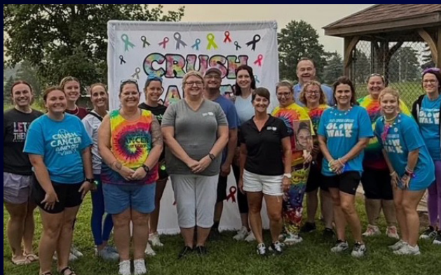
Employees volunteered at the Creston Crush Cancer event. The event raised over $28,000!

Greater Regional Health was named a Des Moines Register Top Iowa Workplace for the eighth consecutive year.