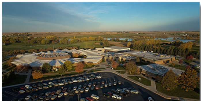
Pictured: Southwestern Community College

Creston is the home to Southwestern Community College and a satellite campus for Buena Vista University. Greater Regional Health partners with SWCC to provide enhanced learning and a clinical site for their nursing program.