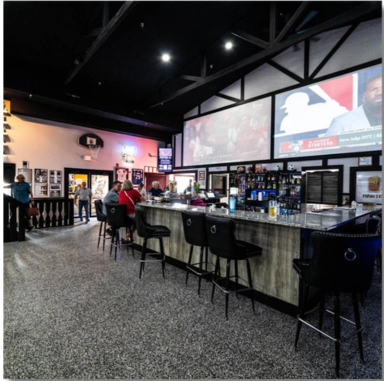
Pictured: Mario's Bar & Grill

A & G Restaurant and Lounge, Adam's Street Espresso, Big Acai, Brick & Bell Café, Casa De Oro, Chuong Garden, Creston Family Restaurant, Don Julio Cantina & Restaurant, Mario's Bar & Grill, Pizza Ranch, Spencer's Chophouse, The Old-Fashioned Bar & Grill, Una Mas Cantina & Grill, Willy's Bar & Grill.