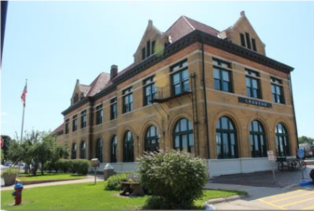
Pictured: Creston's Restored Depot

Creston, Iowa , is a rural hub city of approximately 7,500 residents in Union County (southwest Iowa) known for its relaxed atmosphere, rich railroad history, and as the home of Southwestern Community College. Situated at the intersection of Highways 34 and 25, the town serves as a regional center for healthcare, education, and industry. Creston is the county seat of Union County, Iowa, and was originally settled in 1868 as a survey