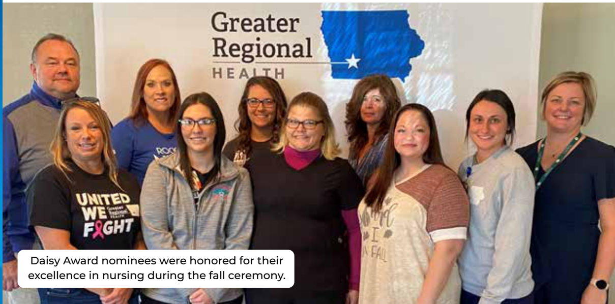
Daisy Award nominees were honored for their excellence in nursing during the fall ceremony.