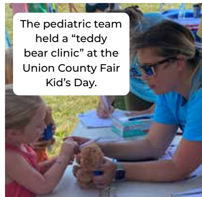
The pediatric team held a "teddy bear clinic" at the Union County Fair Kid's Day.