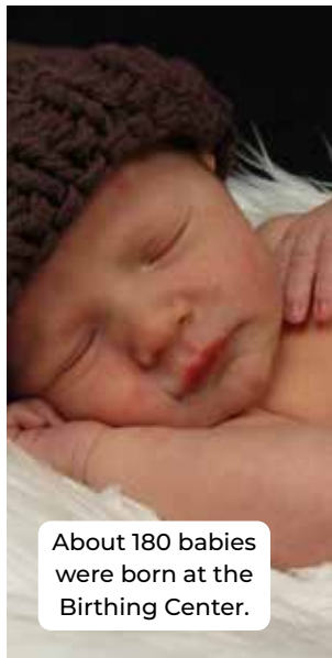
About 180 babies were born at the Birthing Center.