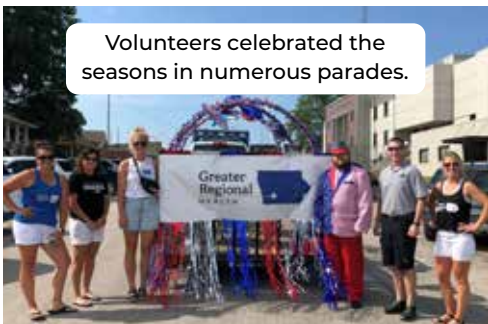
Volunteers celebrated the seasons in numerous parades.