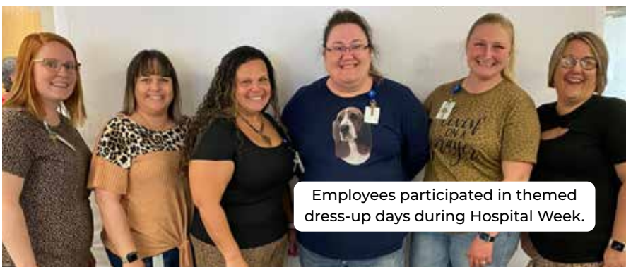
Employees participated in themed dress-up days during Hospital Week.