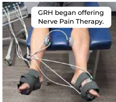
GRH began offering Nerve Pain Therapy.