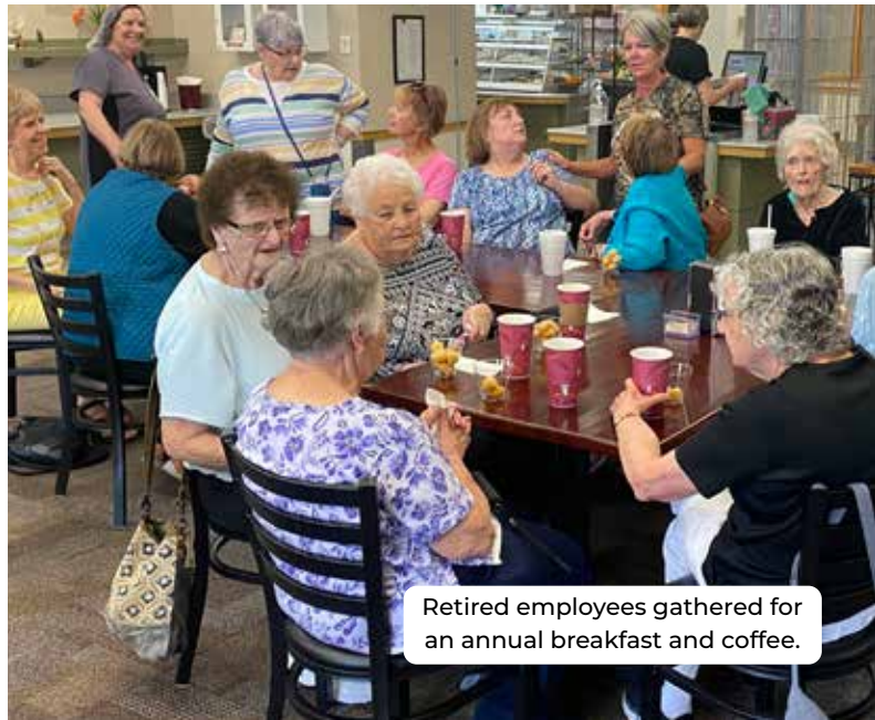
Retired employees gathered for an annual breakfast and coffee.