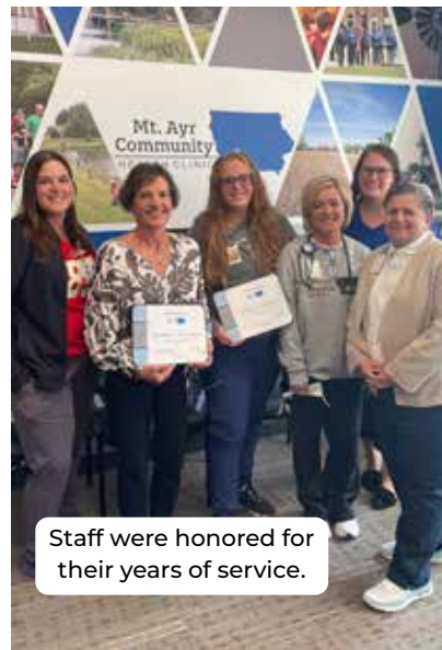
Staff were honored for their years of service.