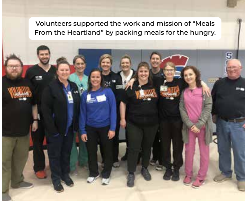
Volunteers supported the work and mission of "Meals From the Heartland" by packing meals for the hungry.