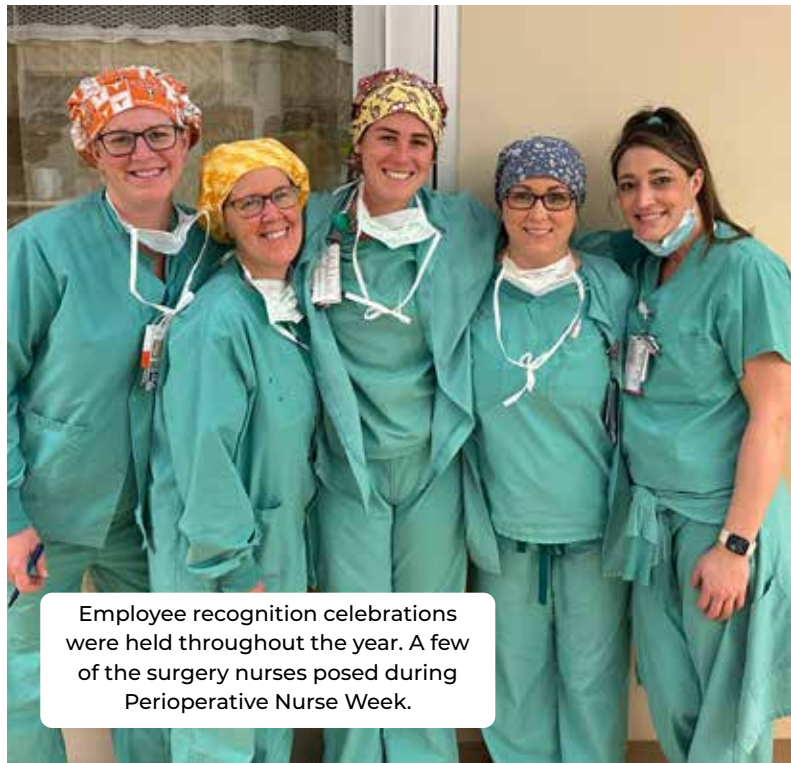
Employee recognition celebrations were held throughout the year. A few of the surgery nurses posed during Perioperative Nurse Week.