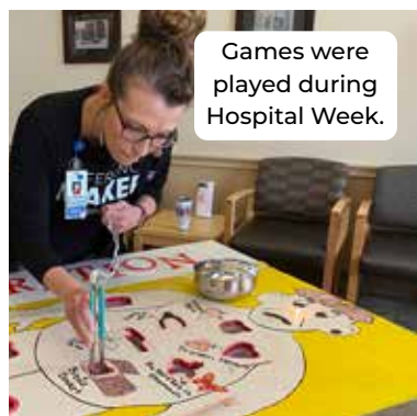
Games were played during Hospital Week.