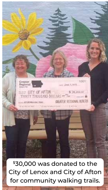
$30,000 was donated to the City of Lenox and City of Afton for community walking trails.