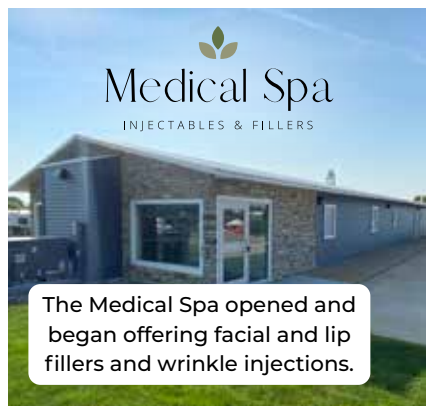
The Medical Spa opened and began offering facial and lip fillers and wrinkle injections.