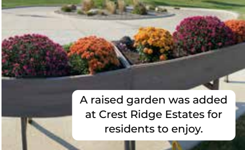
A raised garden was added at Crest Ridge Estates for residents to enjoy.