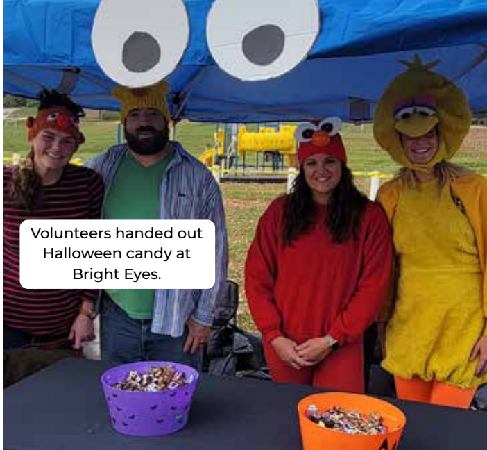
Volunteers handed out Halloween candy at Bright Eyes.