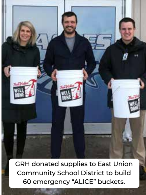
GRH donated supplies to East Union Community School District to build 60 emergency "ALICE" buckets.