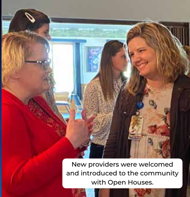
New providers were welcomed and introduced to the community with Open Houses.