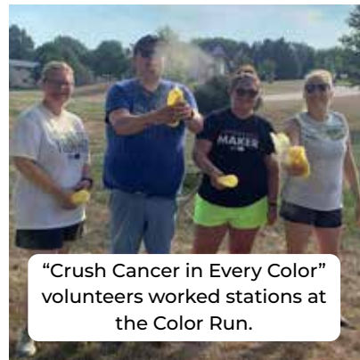
"Crush Cancer in Every Color" volunteers worked stations at the Color Run.