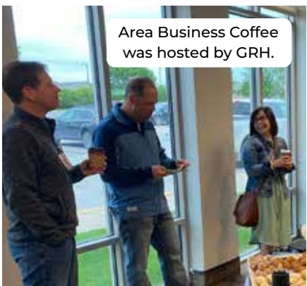
Area Business Coffee was hosted by GRH.